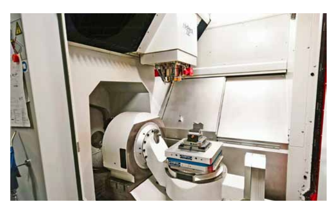
View of the interior: The weight-compensated Z-axis features a lengthcompensated spindle and alignable coolant spray nozzles. The rotary swivel table is equipped with a zero-point clamping system