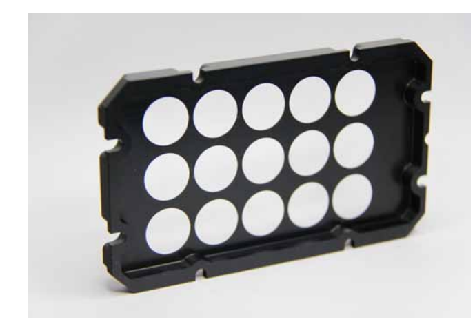
Very thin-walled and therefore sensitive to damage during postprocessing: sensor housing made of aluminium (Photo: Circle)

In this aluminium housing for a hand-held control unit, aesthetic demands for the surface after vibratory finishing, glass bead blasting and anodising are paramount (Photo: Circle)