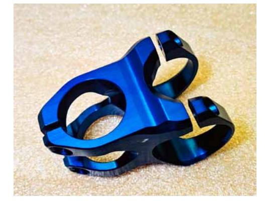
Sophisticated component made of anodised aluminium for a high-quality bicycle

for the first time for the production of sample parts as well as small series made of metal. Mostly aluminium is machined, but also steel, stainless steel and titanium to a certain extent. This special service has been expanded constantly since then. In the meantime, the company has three milling centres and four lathes, including a turning-milling centre. In addition, injection moulding machines as well as equipment for surface finishing such as